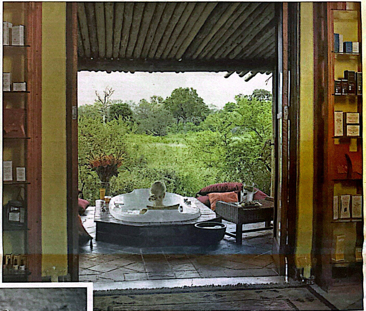
ULTIMATE RELAXATION: Enjoying a hot bath is one of the many ways to unwind at the Tintswalo Safari lodge